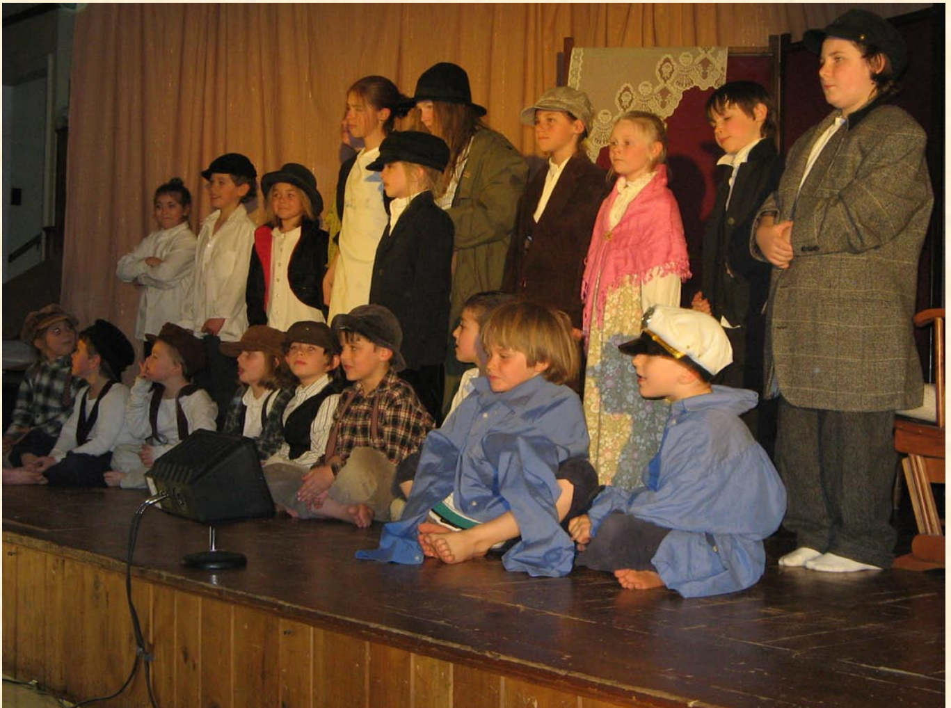
The Cast of Oliver